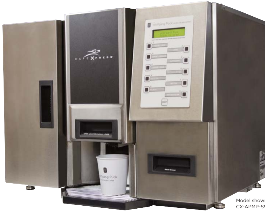
Model shown: CX-APMP-SS

This cutting edge American-made coffeemaker is ideal for commercial applications in office and foodservice environments. Each cup is brewed fresh using individually sealed, biodegradable coffee pods. The machine internally auto-ejects spent pods and is designed for high-volume operation.